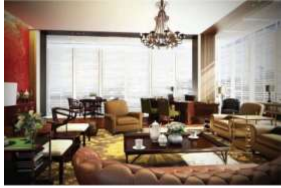
Office of the President of the House of Representatives