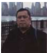
Hon. Mr. Singchai Thunghong

“ Energy Saving: the parliament building is designed to have sufficient natural light, to reduce the heat of the building surface, to have plant growing on the building (plants that are easy to take care of) and energy recycling; like re-using treated wastewater from the ponds in front of the building for watering.”