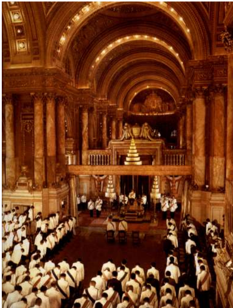
Ananta Samakhom Throne Hall

Message from President of the National Assembly Speaker of the House of Representatives H.E. Mr. Chai Chidchob