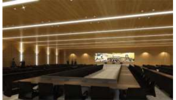
Meeting Room for Budget Committee