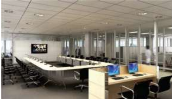
Meeting Room for 30 Persons