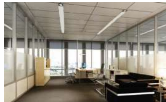
Office of Member of the House of Representatives/ the Senate