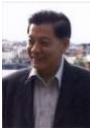
Hon. Colonel Apiwan Wiriyachai

“Soon we will see the New Parliament Building prominently standing on the Chao Phraya River bank. It will be a new landmark for visitors to come by and appreciate the beauty of Thai architecture.”