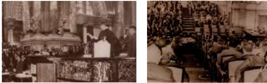
The National Assembly Meeting in the past

Prime Minister H.E. Mr. Samak Sundaravej, President of the National Assembly H.E. Mr. Chai