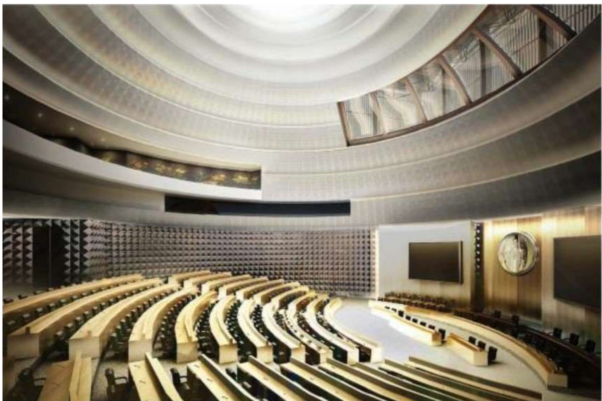
Chantra Meeting Chamber Senate

The creation of walls and roof in the shape of a vaulted chamber gives a rarefied sensation of meeting under the vast, limitless Sky above. The celestial ambience aids vision, imagination and relaxation during meeting that demands the sustained and prolonged exercise of intellectual power.