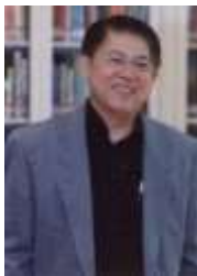
Admiral Thanit Kittiampon RTN

“According to the above reasons, I consequently decided to vote for the Sappaya Saphasathan design and I extremely hope that the New National Assembly Building will eternally represent the parliament of wisdom and the center of people’s mind as the foundation of national morality and good governance under the democratic regime.”