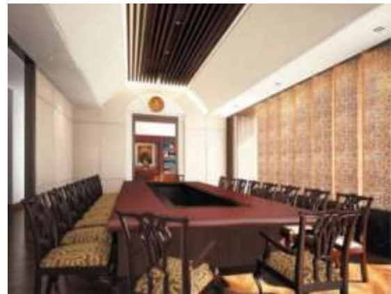
Meeting Room and Lunchroom of the President of the House of Representatives