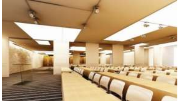
Underground Seminar Room