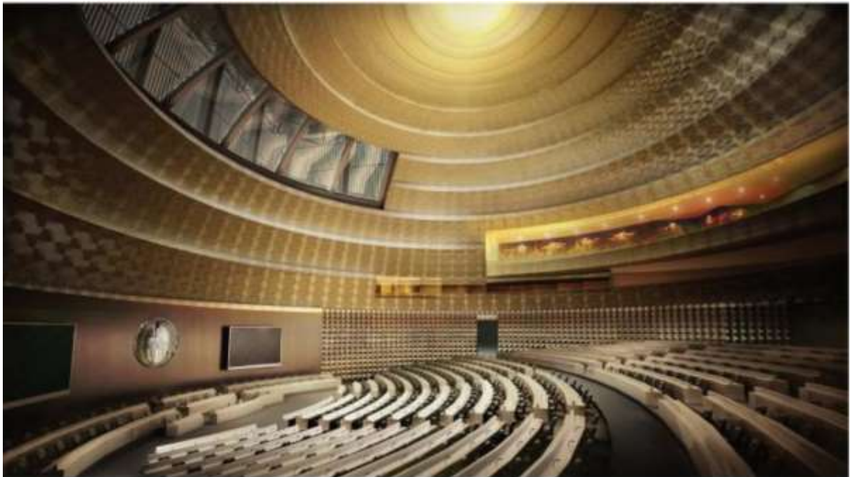
Suriyan Meeting Chamber House of Representatives

Suriyan or Surya, Sanskrit for the Sun God, is the source of all life and myriad things on Earth. Just like the Sun giving light and warmth to preserve life and sustain mankind through eons of time, National Assembly has the sacred task to perform in order to bring well-being