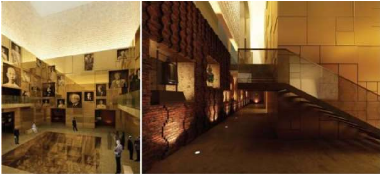
Hall of Fame of Democracy Museum